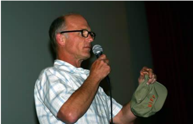
Ed Harris, MIFF 2004 Mid-Life Achievement Award Honoree

During the 10 days of the festival we show nearly 100 films, representing the best of American independent and international cinema. We also spotlight some of Maine and New England's most exciting and innovative filmmakers.